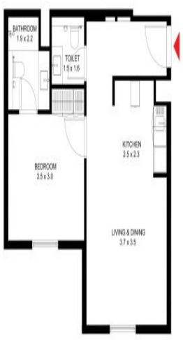
RIFF 6 - Second Floor Plan